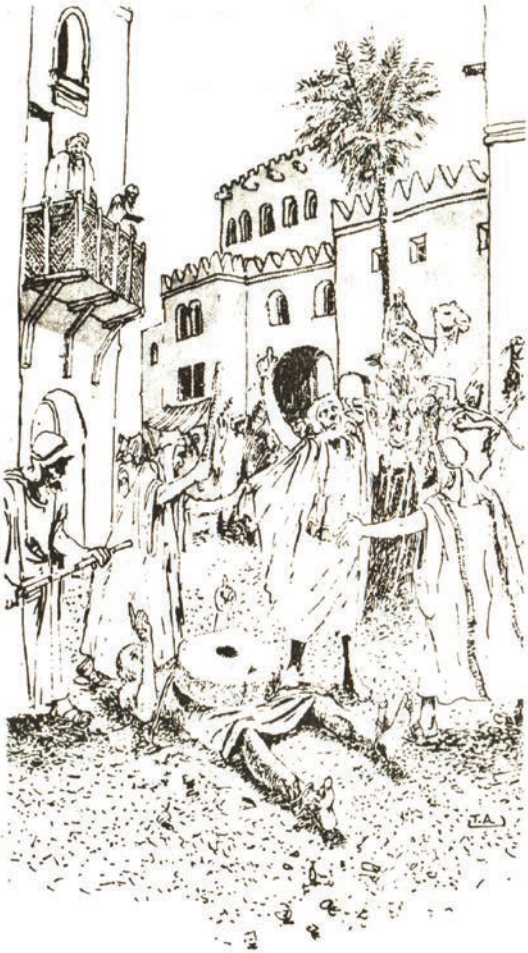
The first African convert to Islam was an Abyssinian slave named Bilal. He was cruelly Persecuted by his master for his belief in the concept of: "One God."