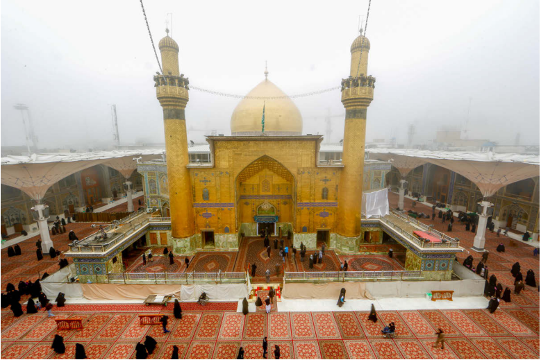
The Mausoleum of HAZRAT ALI (ALAIHIS SALAAM) at Najaf (Iraq)

“I am the City of Learning and Ali is its Gate.”